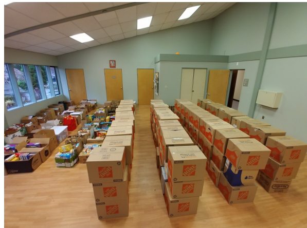
Food for the Break distribution in Anderson Hall.