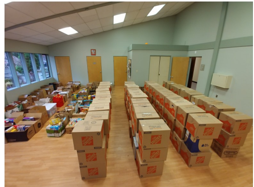
Lunch for the Break in Anderson Hall.

Our next Community Outreach Meeting is Wednesday, November 20 th at 1:30pm. All are welcome!