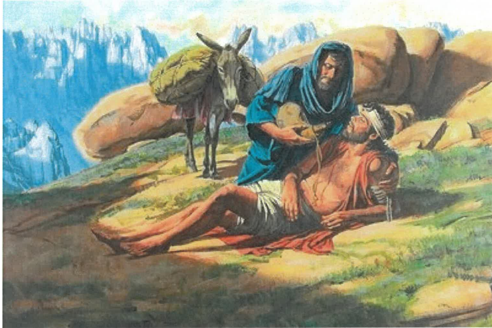
The Good Samaritan

“Which of these three, do you think, proved to be a neighbour to the man who fell among the robbers?” He said, “The one who showed him mercy.” And Jesus said to him, “You go, and do likewise.”