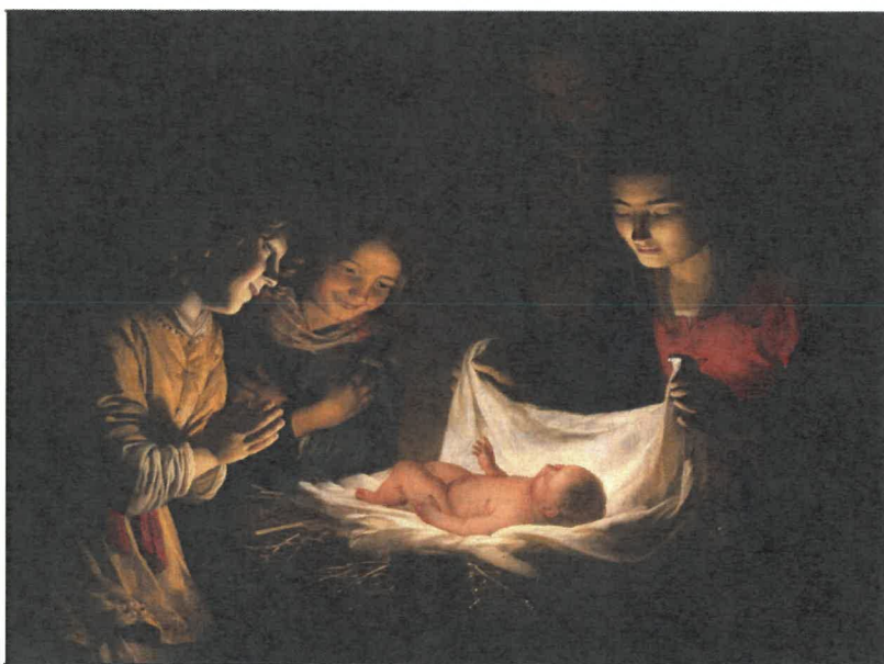
Adoration of the Child , Gerrit van Honthorst, known as Gherardo delle Notti, c. 1619-1620, Uffizi Galleries.